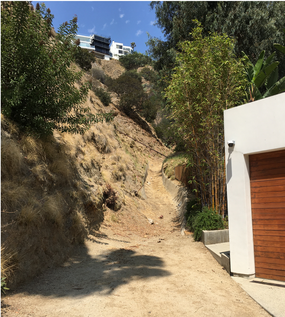
Photo from today at end of Culvert / Top of Marmont with GrandView / Crisler directly above

Just at 1826 Crisler is a low point that directs into a water drainage culvert that connects directly to the top of Marmont Avenue 250 feet below.