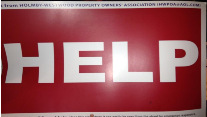
DO need help, place this signwhere it can easily be seen fr